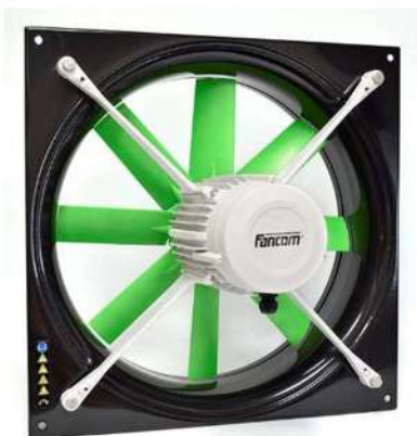
FANCOM 1450p FAN 230v 2.1A 138RMP